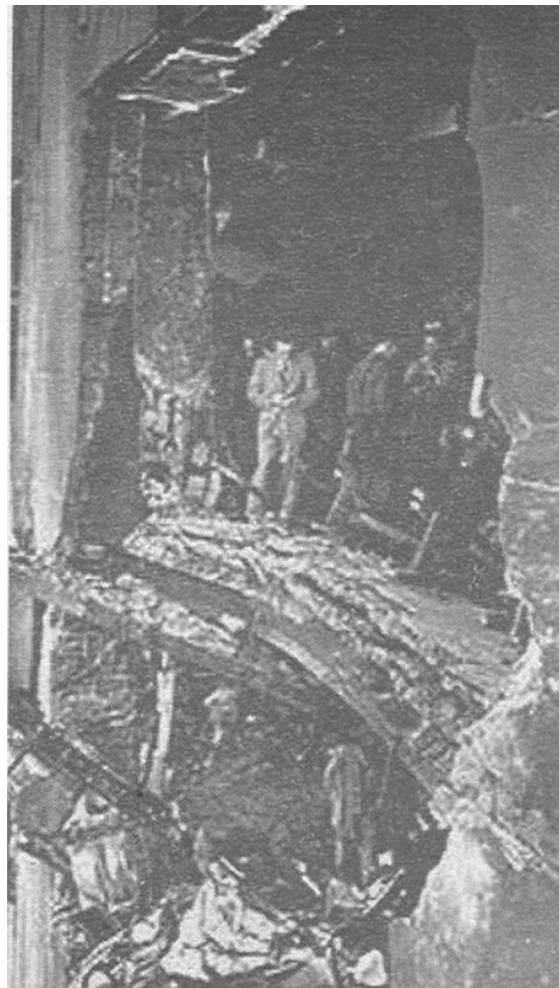
One of the R-25 engines, and part of the landing gear, went through the building, tearing a hole 18 by 20 feet